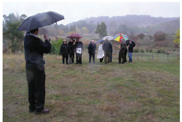
...and left - December 2005!