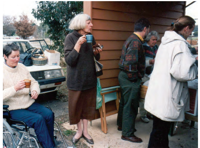
Above 1994, and below 1999...