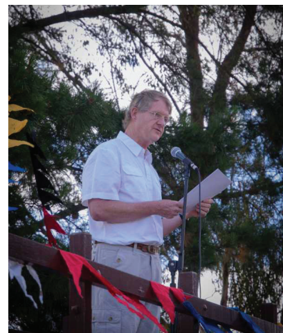
Photos of the Monster Meeting Day. The centre photo and the two below right were courtesy of Rhonda Joyce and that superb Olympus referred to on page 3.